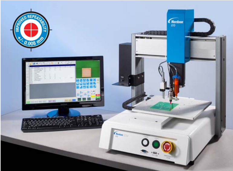
EV Series pencil camera vision makes programming patterns easier.

Easy automation for precise fluid application with simple vision pencil camera