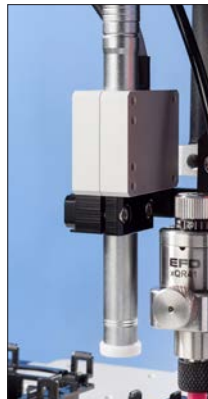
Pencil camera verifies product presence.

Nordson EFD's EV Series automated systems include simple vision for precise fluid dispensing using EFD syringe barrel and valve systems.