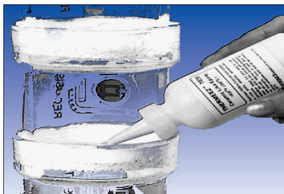
Thermeez™ 7030 Seals a Corrosion Resistant Exhaust System

Commonly used in high temperature exhaust systems, diesel engines, gas turbines, heating plants, etc.