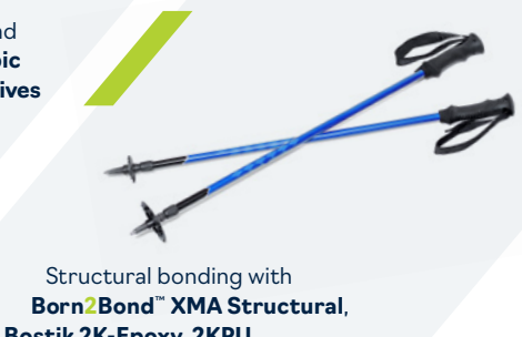
Bostik 2K-Epoxy, 2KPU

Fitness equipment parts bonding and assembly with Born2Bond™ Anaerobic Adhesives, UV-CIPG and Instant Adhesives