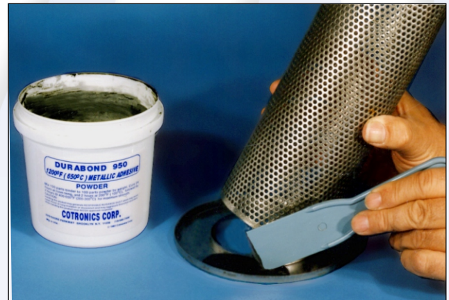
Durabond™ 954 Bonds a Stainless Filter Cartridge for use at 1200°F